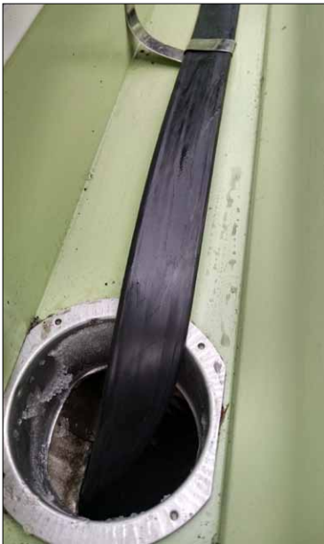
Flexible – Bends easily