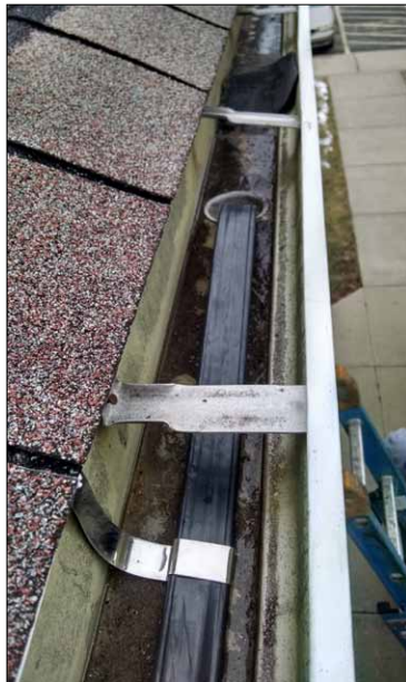
Clips in place