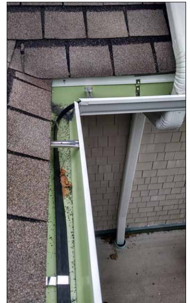
90° angle turns